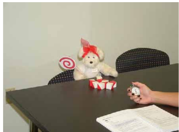
It's one of Candice's favorites too!