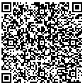
11. Camp Ramah