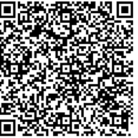
23. Peter Pan