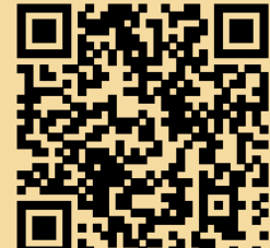
Estrategias para la reunión del PEI