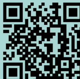
Greater Boston Legal Services