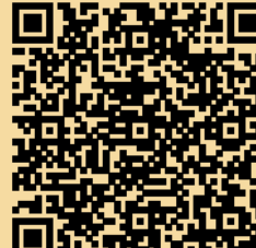
AAC: Supporting Communication