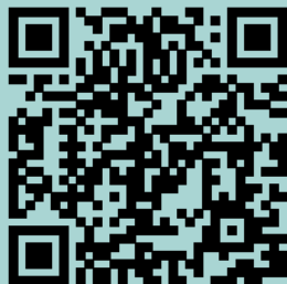
Find an Autism Support Center