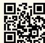
Treasure Trace Underwear