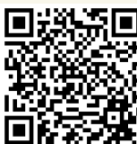
Project Lifesaver Guide

*If cost prohibited, speak to your PCP or DBP about financial assistance