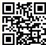
Amber Alert GPS