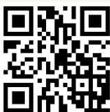
JoiBit Smart Tag