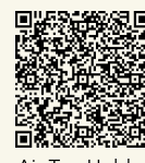
Air Tag Holder