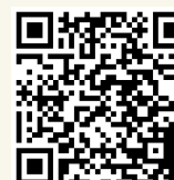
Verizon GizmoWatch 2