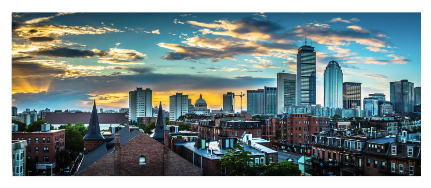
"Time and again, those interviewed said they also found solace when they received care by people who looked like them." - Boston Globe, 12/2017